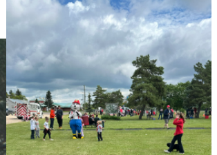
Sparky & Goats!!